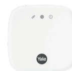
Yale Connect Plus Hub 2

Add the Yale Connect Plus Hub 2 and easily monitor and control your Yale products from your smart-phone.